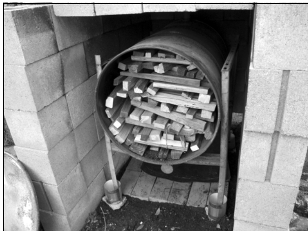
The loaded retort inside the kiln.

This low cost wood-fired biochar kiln can be even cheaper if you have some of the materials already lying around or if you have welding skills. The kiln uses any small dimensioned, dry feedstock that won't pack together - sawdust or wood chips are too small. Wood chunks, sticks or stalks will work better. The feedstock needs to be loaded into the retort with air spaces so the gas can vent. Depending on the feedstock, you can make 20–40 lbs of charcoal in 2-4 hours.